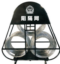
Triple Barrier (Black/Army Green)