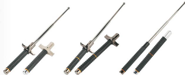
Knife blocking stick (21 inch/26 inch)