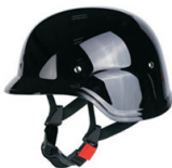
German riot helmet (black)