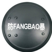
Aluminium alloy tactical round shield