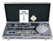
Security kit (standard 9 sets)