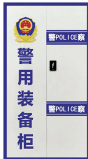
Intelligent police equipment cabinet