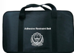
Police Adhesive Restraint Belt