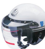
Police riding winter helmet