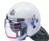
French Riot Helmet (White)