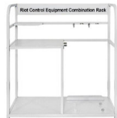
Medium riot control equipment rack (white)