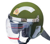
Military French riot helmets