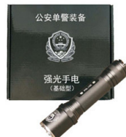
New standard torch