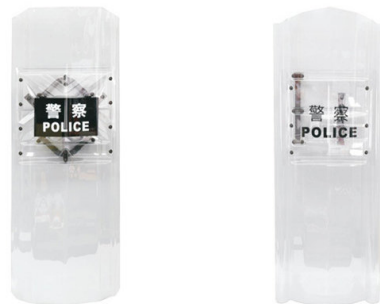
1.6m Double Handle Czech Shield Reinforced 1.6m Czech Riot Shield