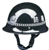
Black riot helmet (wheat)