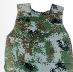
Jungle Camouflage Body Armour/ Stab Protective Clothing