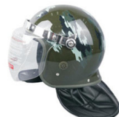
Military camouflage French riot helmet