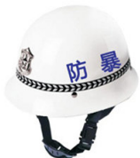
White riot helmet (wheat)