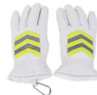
White skin curved fingers