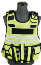
SK-80 Tactical Vest (Fluorescent Yellow)