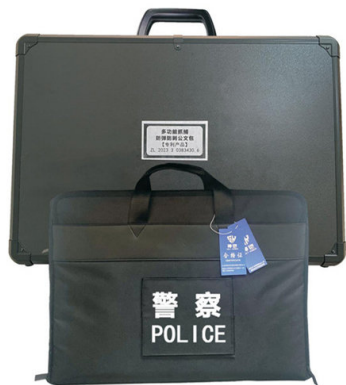
Name: Multi-functional capture bulletproof and stab-proof briefcase

Security personnel in the protection of important people, need to be equipped with the appropriate protective gear, such as bulletproof shield, restraining belt, carrying a bulletproof shield is very unsightly, and in public places when not in line with the need for covert protection. May cause panic among the masses and the detection of criminals, this product is a bulletproof and anti-stabbing briefcase with a restraining belt function, with easy to carry, beautiful and undetectable advantages. In the unfolded state, both hands are inserted into the first restraining pocket and the second restraining pocket respectively, and the first and second velcro layers are adhered as restraining straps. Apprehension and control of suspects, and hidden briefcase shape, further reduce the suspect's vigilance, easy to capture, minimise security personnel personal accidents and casualties.