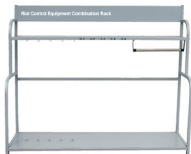
Large Riot Control Equipment Rack (Grey)