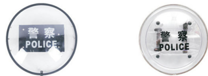
French Riot Shield Reinforced Hong Kong Style Round Shield