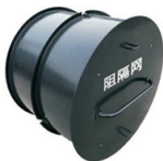
Single Barrier (Black/Army Green)