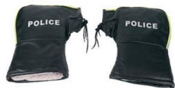
Police motorcycle protective gear