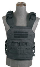
SK-65 JPC Tactical Vest