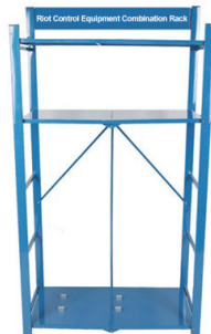
Riot Control Equipment Rack