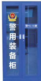
Police equipment cabinet (blue)