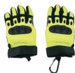
Green anti-cutting cloth shell