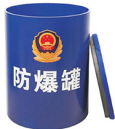
Explosion-proof tank (special steel; Single layer)