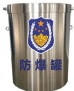
Explosion-proof tank (stainless steel; Two-tier)