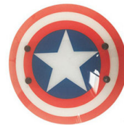
PC Captain America Round Shield