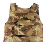
Military Desert Camouflage Body Armour/ Stab Protective Clothing