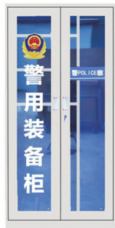
Police equipment cabinet (white)