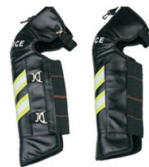
Police protective gear