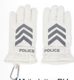
White letter PU