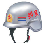
Military picket helmet (Silver gray)