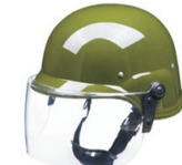
Military German riot helmet with mask