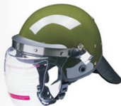
Military American riot helmets