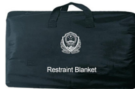
Police Restraint Blanket