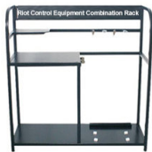
Riot control equipment rack, medium (police blue)