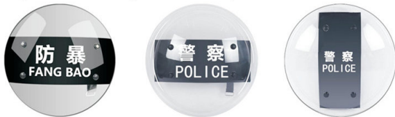
Ordinary Riot Shield Hong Kong Style Riot Shield Australian riot shield