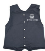
Police Internal Body Armour