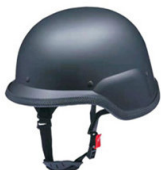
German style bag Storm helmet (black)