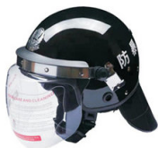
American riot helmet