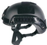
Mickey Tactical Riot Helmet (Black)