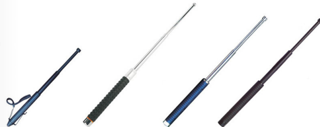
Pen stick (13cm-39cm)