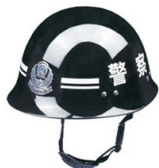
Police Service Helmet(Black)