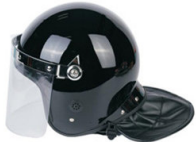
French Reinforced Riot Helmet (Black)