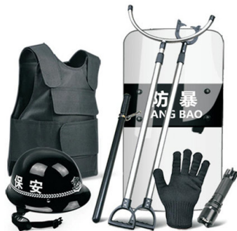
Security eight pieces (suit)