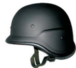
German style bullet-proof helmet