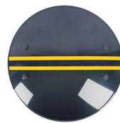
PC Black Round Shield