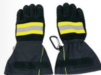
Black cotton fire prevention