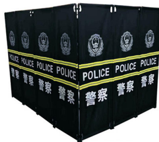
Police Combination Fence