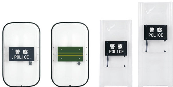
French Riot Shield Armed Police Riot Shield 1.2m Riot Shield 1.6m Riot Shield