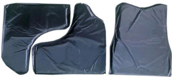
Stabproof inner liner