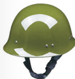
Military anti-riot helmet