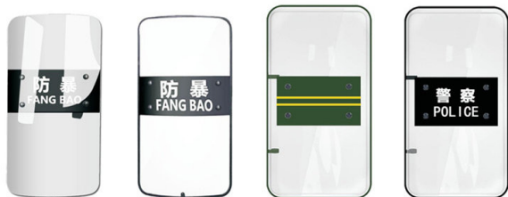
Ordinary riot shield Hemming riot shield Armed police riot shield German riot shield