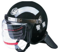
French riot helmet