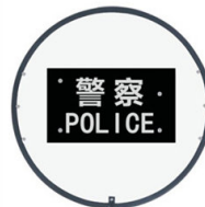
PC French Riot Shield