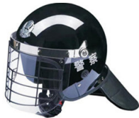
European-style steel mesh riot helmet