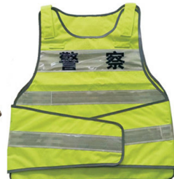
New label reflective vest