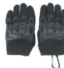
2107 Cloth shell