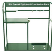
Medium riot control equipment rack (army green)