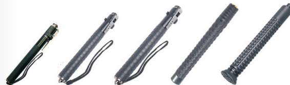
Spring Baton (16 inch)