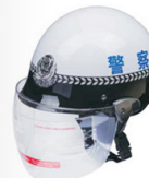
Police cycling helmet