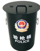
Police gun barrel