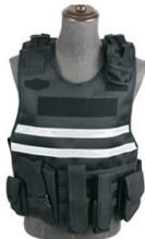
SK-80 Tactical Vest (Black)