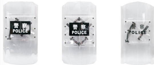
1m Single Handle Czech Shield 1m Double Handle Czech Shield 1m Reinforced Czech Riot Shield