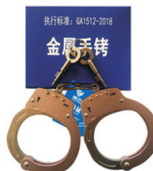
New standard Handcuffs