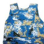
Military Marine Camouflage Body Armour/ Stab Protective Clothing