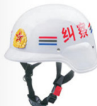
Military picket helmet (white)