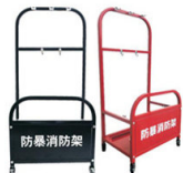
Mobile riot control fire stand