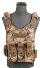
SK-130 Quick Release Tactical Vest