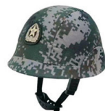
Military camouflage riot helmets