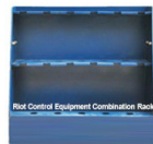
Conventional riot control equipment racks