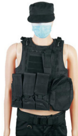
Quick Release Tactical Vest