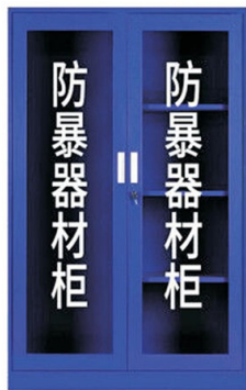
Riot Control Cabinet (Blue)