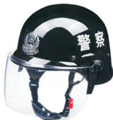
German riot helmet with mask (black)